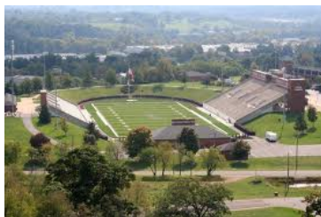
An aerial view of the beautiful Salem Stadium in Salem, Virginia.

Salem Stadium holds many high-profile football events each year, including the Amos Alonzo Stagg Bowl, more commonly recognized as the NCAA Division III National Championship. This past weekend, The Dream Bowl was held there, a convergence of various college All-Stars taking the field to honor Martin Luther